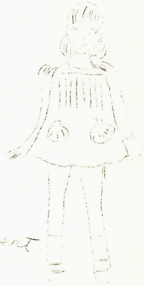
Miss. In Buttons 1928